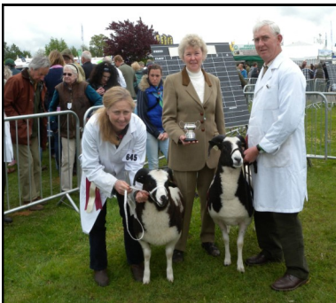
Devon County Winners