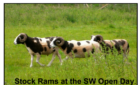
Stock Rams at the SW Open Day

d. Photos needed. Please do bring some to the AGM for a Photo competition! Nice up to date close ups of good sheep or picturesque flock ones for the boards are needed each year.