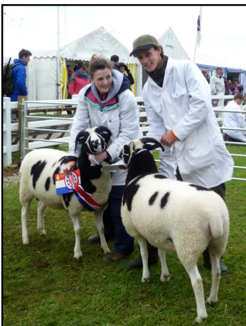
Royal Cornwall Winners