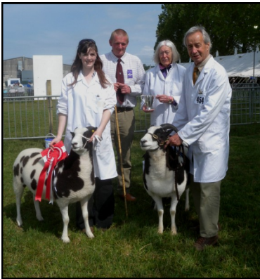
Royal Bath & West Winners