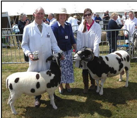
Devon County Show: From left: Champion & Reserve Breed Cham- pions: See results above right.

Jacob Sheep Society Website: www.jacobsheepsociety.org.uk