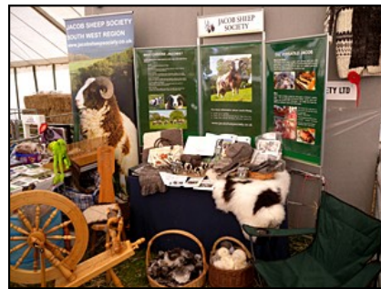
Devon County Show winning stand