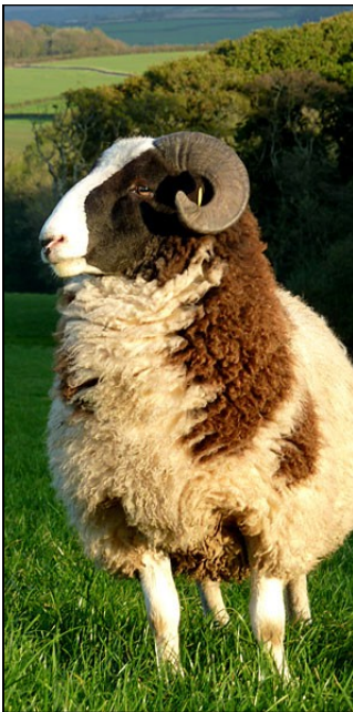
Winning photo of a ram lamb to be used for a pull up banner for the SW Region.